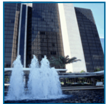
Renaissance Hotel Houston TX

This agreement constitutes the full and complete agreement between the parties and supercedes all prior agreements between the parties or their representatives oral or written, including all practices not specifically preserved by the express provisions of this Agreement.