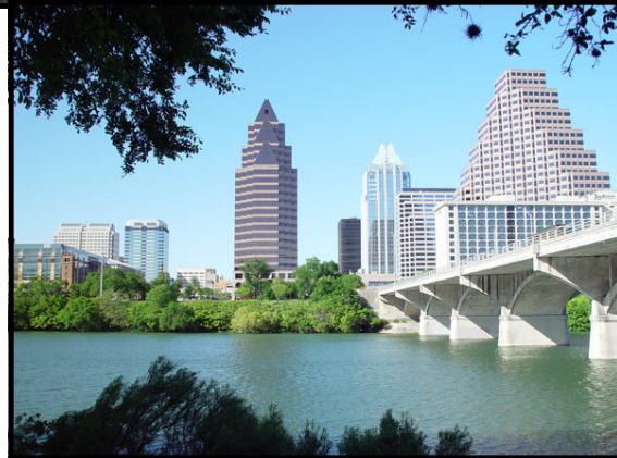
2007 TCMA Conference Austin, Texas

Cash drawings, Presenters, Vendo-Rama, Vendor Room, Carrier of the Year Winners